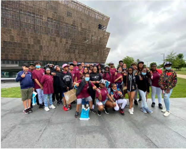
6th Grade DC Trip