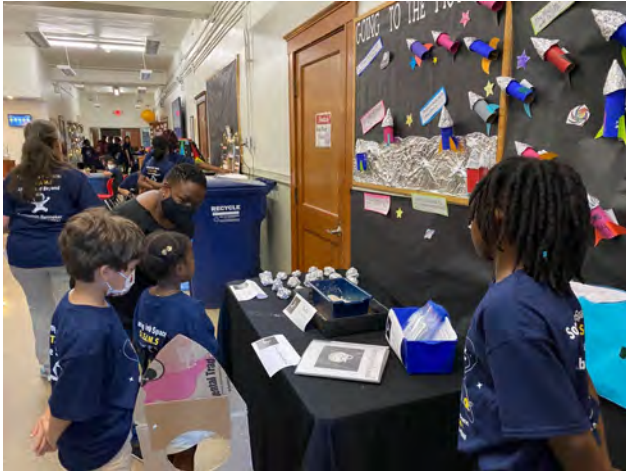
Banneker's STEAM's Expo