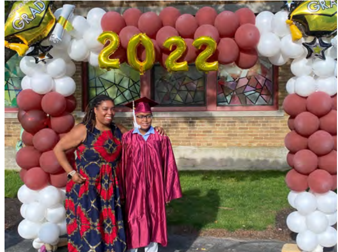
6th Grade Graduation!